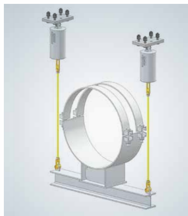
load chain designed in FLEXPORTE®. The exported 3D CAD data can be imported into any CAD software