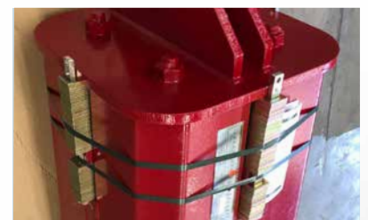
Spring hangers for high loads and long spring travel being prepared for shipment according to customer guidelines