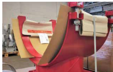
HYDRA® FSN fixed support with nominal diameter DN 1000 for high loads and moments with duplex-multi-layer coating